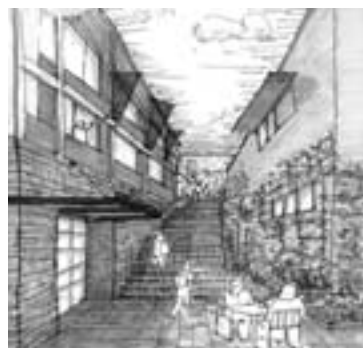
Vision for Future Facility

nity groups and representatives, the Jackson Place Board signed a Good Neighbor Agreement with CASA Latina in January. The agreement was developed to address concerns about the design of new and remodeled buildings, loitering, public safety and litter. An advisory committee was formed, including two residents of Jackson Place, to