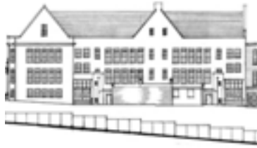
Section of the old Colman School site of the new Northwest African American Museum