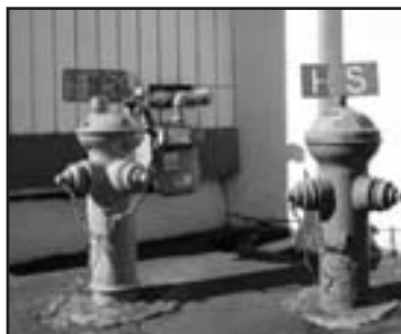
Hers and his fire hydrants in front of Rainier Veterinarian Hospital